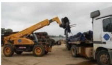
XC6-4517 telescopic handler working on a construction site in Gabon