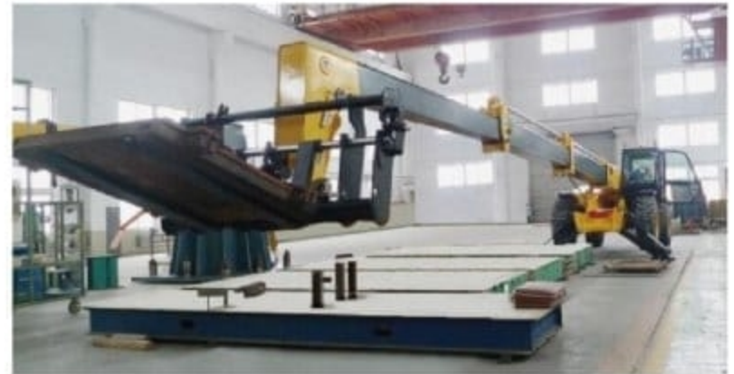
XC6-4517 has passed fatigue load and overload tests of 200,000 times