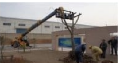
XC6-4517 telescopic handler in tree planting activities