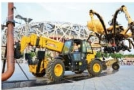
XC6-4517 telescopic handler backing at the 50 anniversary of diplomatic ties between China and France